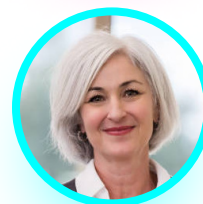
Administrators like You! Thank you for the feedback! We will always listen, respond, and address your needs!