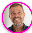
Administrators like You!

Chief Medical Officer Child and Adolescent Psychiatrist, Harvard MD